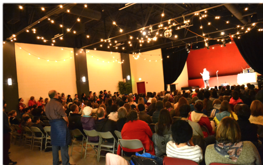
Aspen Words Youth Poetry Slam on Feb 27