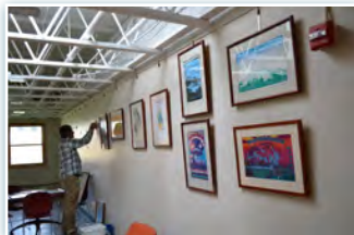
NEW SPACES COMPLETE