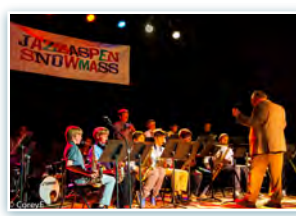
WELCOME TO THE TSC FAMILY!