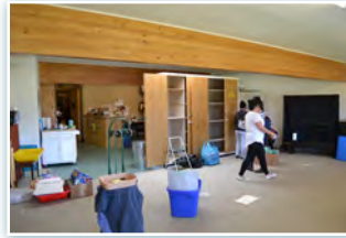
MASTER PLAN TAKING SHAPE